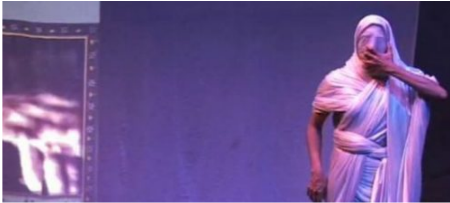
Video: The Thorn, the Leaf, and the Butterfly (excerpt) // password: thorn