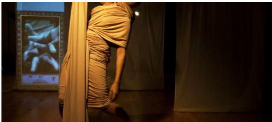
Sunoh! Tell Me, Sister