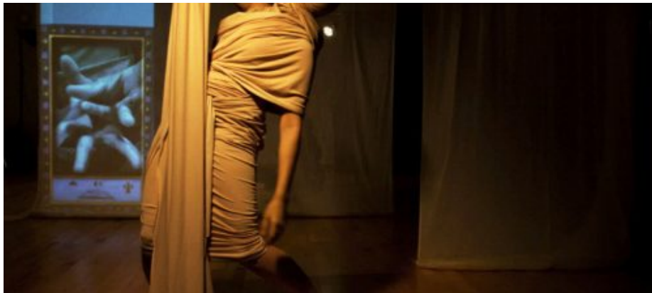
Sunoh! Tell Me, Sister