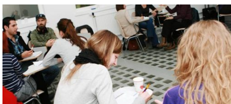
Workshop with UBERMORGEN