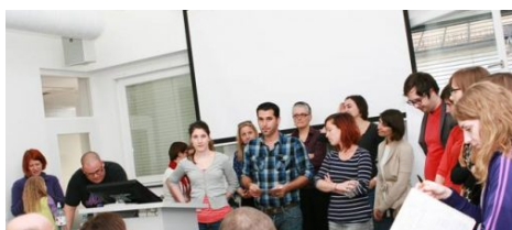
Presentation of final results