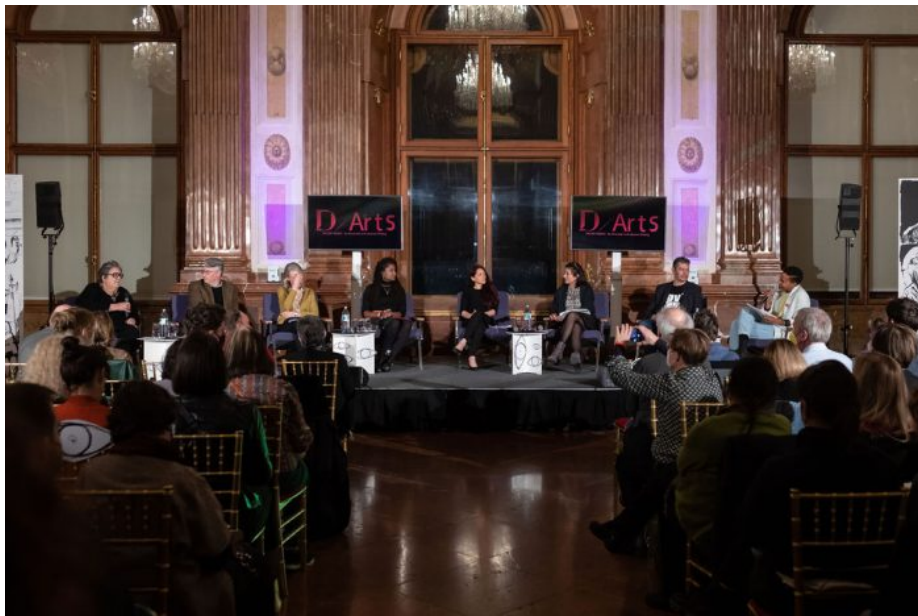
Panel, Belvedere © Ouriel Morgensztern

background or viewpoint, or expertise, of critics as a profession.