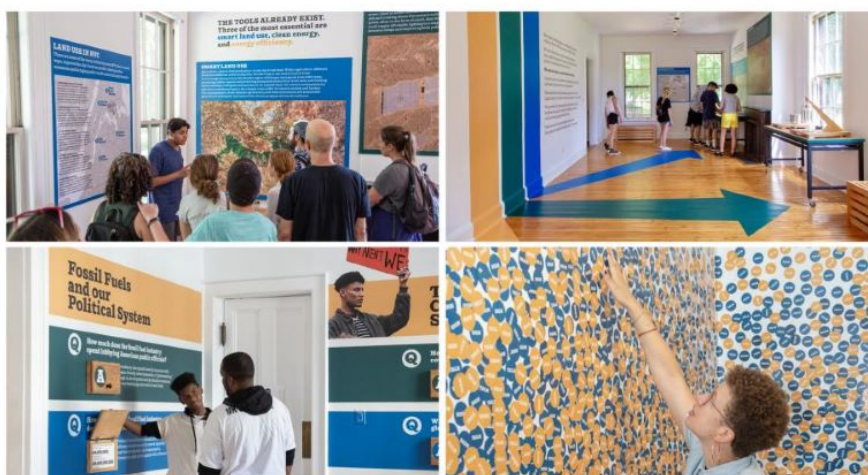
The Climate Museum's 2019 exhibition, Taking Action, on Governors Island.

DP: It feels like the action room from Taking Action has informed every program that's followed since then, and we build an action ask into all of our